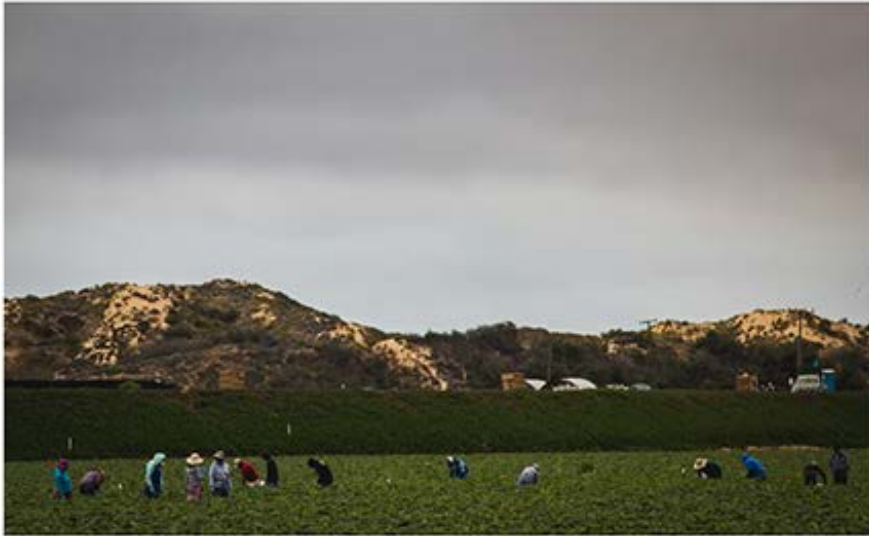
California Farm Workers